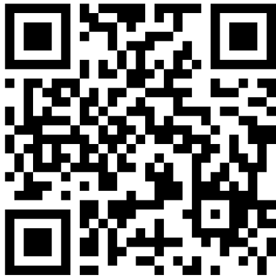
Sponsorship Application https://forms.office.com/r/rP0xErfS5z